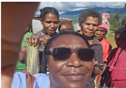
Me surrounded by locals in Dusing.