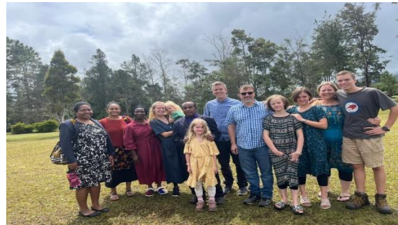
MAF team and families at lalibu outreach