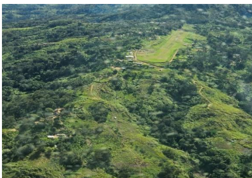
Beautiful landscape and airstrip on approach to Dusin