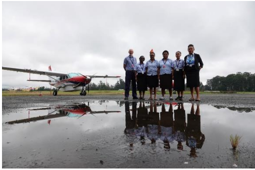
Finance team members in front of a Cessna C208 on PNG air terminal.

A recent opportunity arose to join a flight to Dusin, a remote community just 20 minutes from Hagen. The airstrip, nestled alongside a mountain ridgeline, was a stark reminder of the importance of MAF's work in connecting isolated communities. It was eye-opening to see firsthand how our finance team's meticulous work ensures smooth operations, from reconciling flight cash to supporting our pilots in their mission.