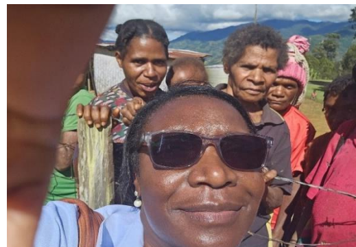
Surrounded by locals at Dusin.

The outreach, to lalibu with my MAF colleagues involved visiting a local church, where I had the privilege of sharing the word with over 15 new converts. It was a humbling experience to witness the impact of our work on the ground and to connect with the local community in such a meaningful way. Outreach pictures on the next page.