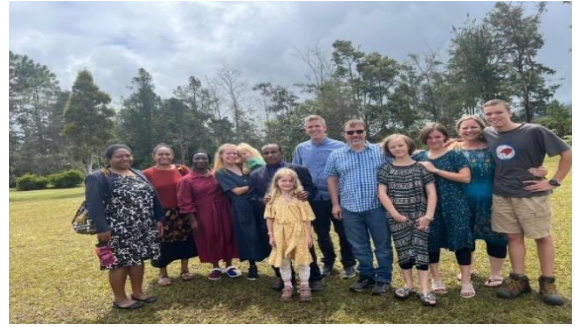
MAF team and families at Lalibu outreach