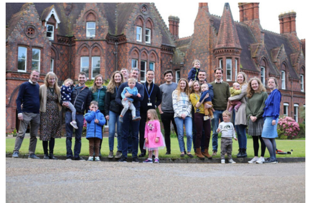
En Route 51 Class

'En Route' is the course we've been studying which has covered many topics from dealing with culture shock and transition, to looking at different world views and religions. It's been packed full of everything we need to help prepare us to live and work cross culturally! The experience of living in a community where over 30 different nations are represented has also been an amazing education! We've enjoyed meeting so many new people and hearing all their stories.