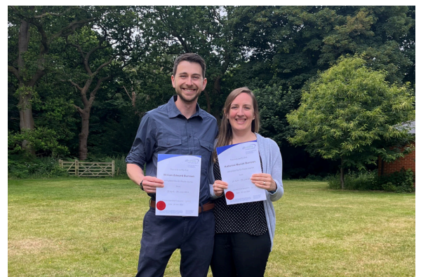
With our certificates!