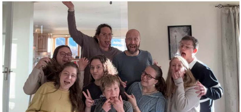
Some of our wonderful friends from Scotland!