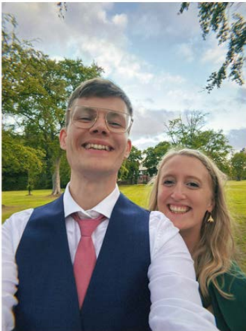
Cheesy grins from Bournemouth