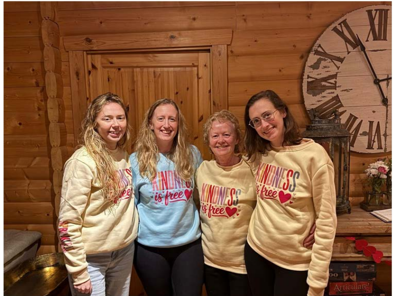
A wonderful lodge/spa retreat with my sisters and mum!