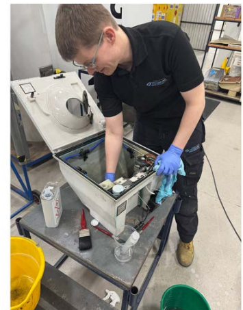
Some days you fly high, others you clean a loo...