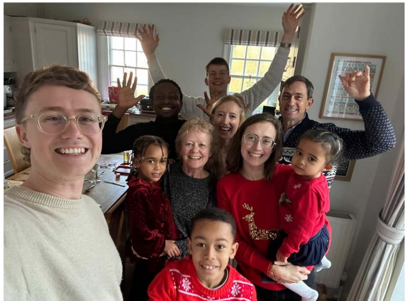
A very happy Christmas Day!