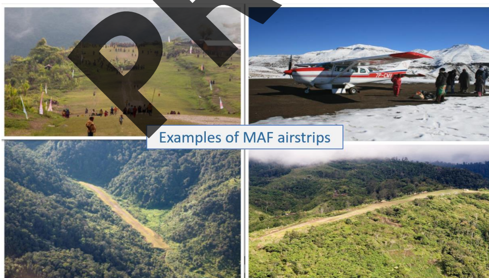
Examples of MAF airstrips

Although landing on tiny airstrips like these can be a challenge, it's often the only way MAF can assist when natural disasters strike, medical emergency flights are needed or people in trouble need help.