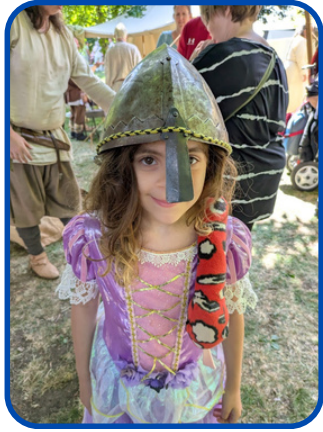
Viking Athena at the medieval market event in Evesham