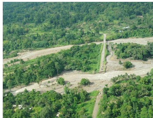
Left: Survey flight route Right: Damage to bridge