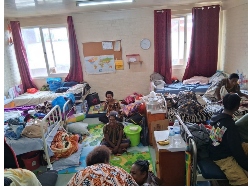
The overflowing neonatal ward