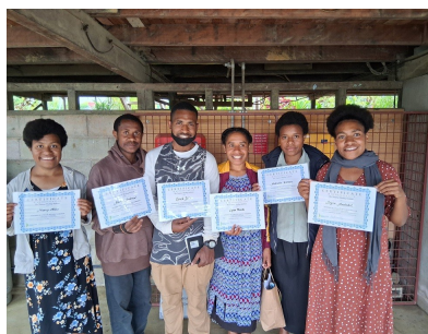
Above: Photos from the OSBTH course in Mount Hagen