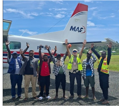
Clockwise from top left: Aid being loaded into MAF Caravan, MAF Bougainville team, Young medevac patient, Arrival of Australian Aid