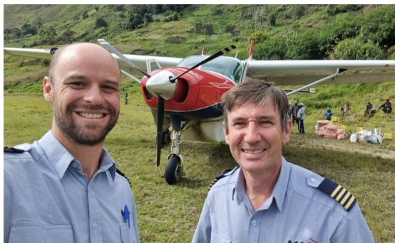
The Andys at Tapmange, Finisterres mountains. A delivery of store goods has just been unloaded.

It's a privilege to be able to help expand the knowledge, capability and flexibility of the MAF PNG pilot pool in this way. Please pray for all the training that goes on in program, enabling MAF PNG to reach the isolated communities we serve.