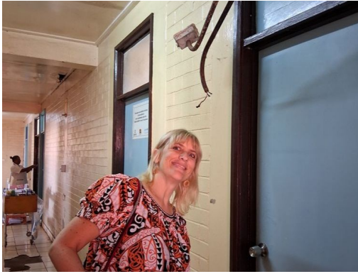
(Live?) electrical cables dangling from the hospital ceiling outside the neonatal ward.