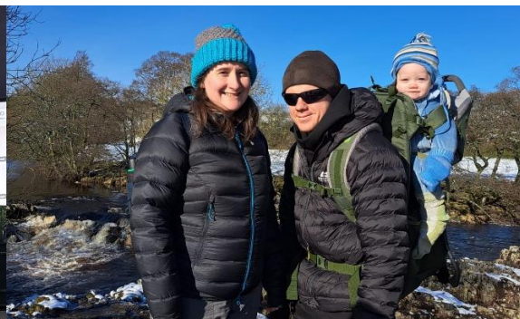
A winter walk