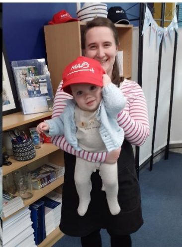
At the MAF offices