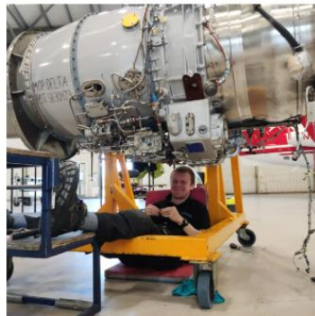
Studying for the type cores and changing an engine.