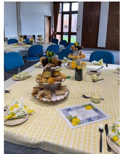
Ladies afternoon tea event