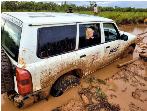
MAF pilot vehicle in Balimo on its daily route from the housing to the airstrip during the current extreme wet season in the Western Province

Or the tribal fighting that within days of the Landslides that lead to the death of almost a dozen people and destruction of possibly as many homes as in the landslides. The main Okuk Highway from Lae to Mount Hagen and onto Enga has had a resurgence of violence with 7 incidents last week including missionary organisations such as SIL (Wycliffe) robbed.