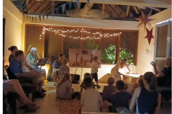
The all-singing, dancing and wonderful gospel sharing of the Watoto Christmas Cantata, and the more reflective Compound Carol Service