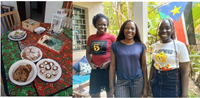
Hosting Christmas tea for JCA teaching friends