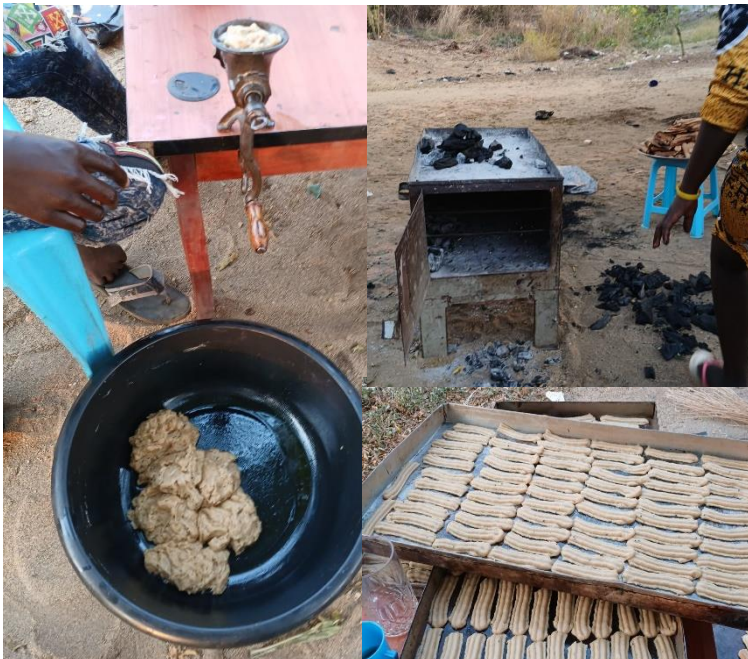
Neighbours following South Sudanese tradition of Christmas biscuit making

New Year's Eve traditions: Joining our Dutch friends for Olie Bollen followed by an evening bonfire and game of hide and seek in the dark!