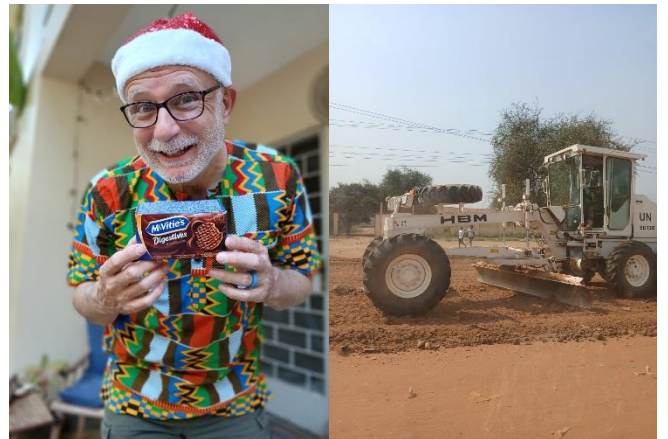
Best Christmas present...Choccy Digestives or having the local road graded by the UN?