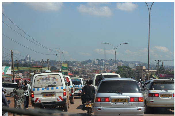
This, we won't miss