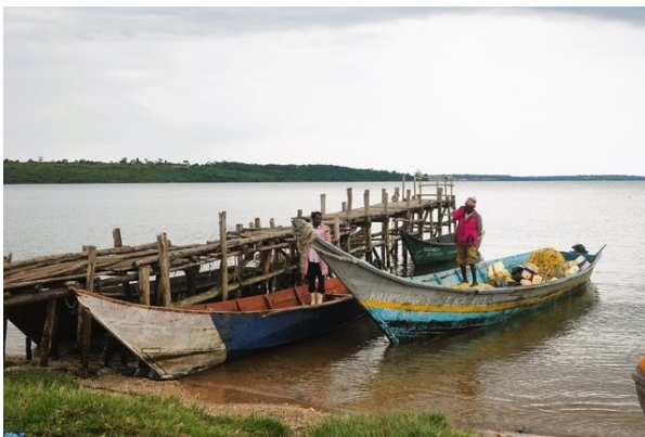
Site of one of the float plane jetties