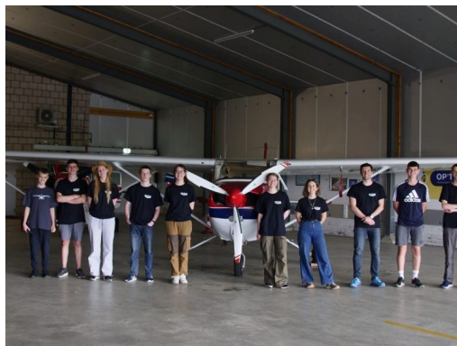
The MAF Co-Pilot Team