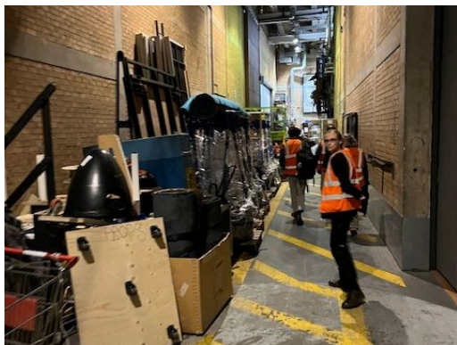
Back Stage at the National Theatre