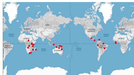
MAF's map of needs