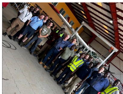
Final Hangar Team Photo

Thank you, thank you, thank you, thank you