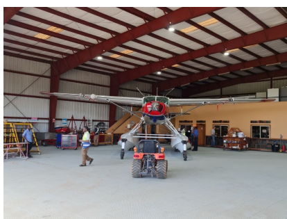
Phew it fits !