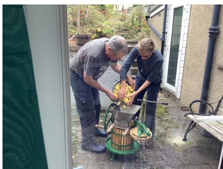
Making apple juice