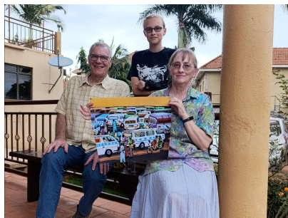
Our presentation from the Uganda team