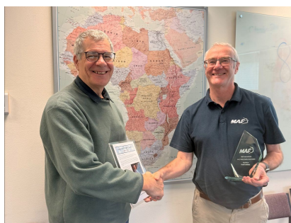
Safety Award Presentation