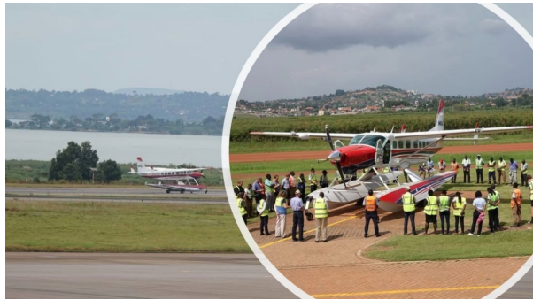
Arrival of the MAF Uganda Float Plane