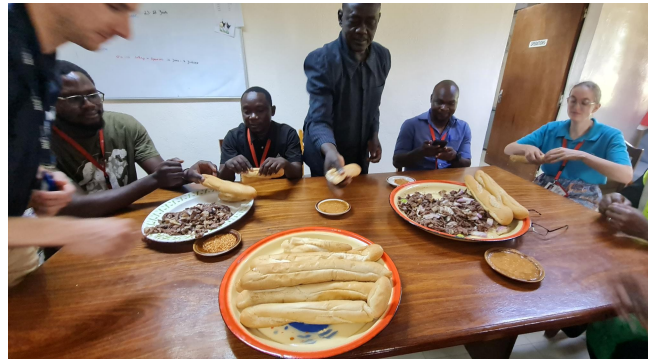
A Camel lunch with the MAF Chad team

We would appreciate your prayers for the Chad program, they are having a tough time at the moment as they don't have an onsite engineer, which makes keeping the aircraft flying difficult. Also, because the USA have stopped issuing visas to Chadians, the Chad government has also now stopped issuing visas to Americans. This means that because lots of the missionaries that are working in Chad come from the USA, they are having to return to the US when their visas run out. This has a knock-on effect to the amount of flying MAF are doing, as the need for people to travel is reducing. Please pray that Chad would start to renew missionary's visas and the people of Chad would continue to receive the help they need.