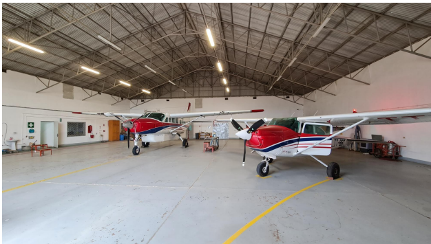
The MAF Chad hangar

I have just come back from a trip to N'Djamena in Chad where I went for two weeks to help with a maintenance check on their C208 Caravan. It was really interesting to experience another African culture and see how MAF works in another place. I enjoyed using some of my high school French to try and communicate with the local staff and trying some local food, including Camel (which tastes like slightly chewy beef, but very tasty)!