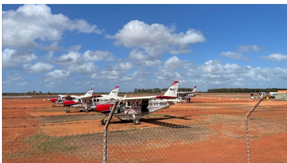
Top: Some of the MAF Arnhem Land aircraft outside our hangar in Nhulunbuy (Gove), our home base; Bottom Left: A homeland community with a small airstrip; Bottom Right: The start of 'The Track', the only way in or out other than by aircraft - the closest asphalt road is 700km away.

The one final significant thing that happened in November was our trip to Arnhem Land, to get a feel for things there. We had such a great time exploring where our new home will be, and getting to know the MAF team out there. Do see the photos below that show a little of what it is like in Arnhem Land - of course more will follow as we settle next month!