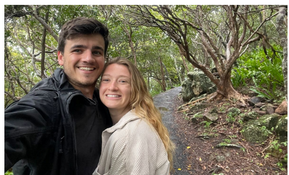
A couple photos of us exploring Queensland, Australia over this Christmas break!