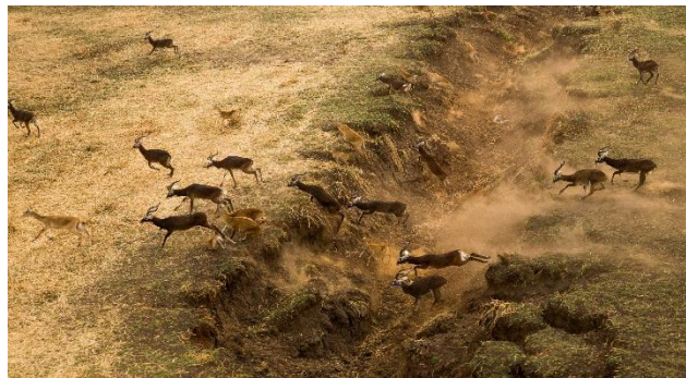
White eared Kob, the Great Nile Migration, David Simpson African Parks

South Sudan is often in the Top Ten charts for shocking reasons. For example, recently we were classified at #1 as the country hit hardest by Food Inflation (164%). To hear good news can be so encouraging. African Parks has just announced that the world's largest land mammal migration, the Great Nile Migration, has been confirmed in South Sudan, involving approximately 6 million antelope. Read about it here!