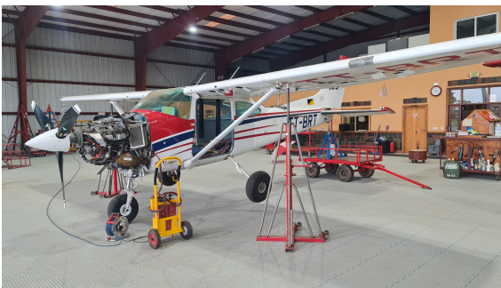
TT-BRT being 'leveled' for autopilot calibration...

The run up to Christmas week has been very busy for us all. The girls have all had their Christmas performances at school, and Steph has been making preparations for the holiday. In the hangar I have been very busy finishing off the installation of a new autopilot into one of our Cessna 182's, alongside the normal daily activities of keeping our other aircraft flying.