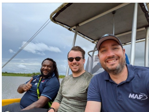
Exploring PNG by boat to consider where new technology could help in areas like agriculture and medical care.