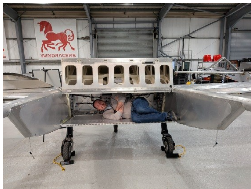
Required research? How many engineers can you fit inside a cargo drone?

That's just scratching the surface! It's a long process, and we're always open to turning a new tech down if it doesn't fit. But it's great to be exploring how we could improve our reach, and considering what the future could look like.