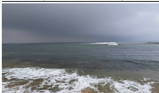
Stormy skies in Liberia's rainy season.