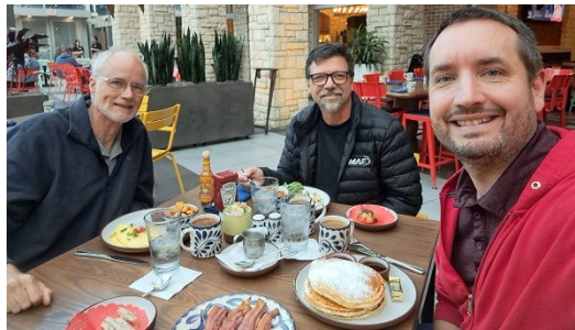
Breakfast in the States with MAF colleagues.

There's no way to deny the challenges we're facing right now, but we continue to see God's goodness in both the small and large details of our lives here. We are always blown away by the stories we hear, facilitated by the work of MAF in Liberia: children who can receive an education, patients who can receive medicine, the hopeless hearing about the love of Jesus.