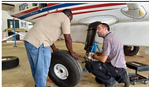
Training our future Liberian engineer.