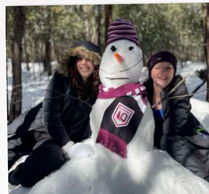
DO YOU WANT TO BUILD A SNOWMAN?