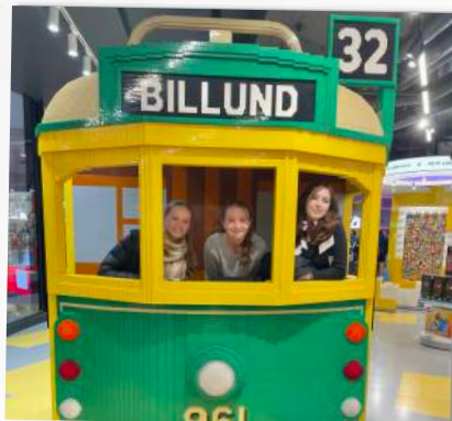
CATCHING UP WITH FRIENDS