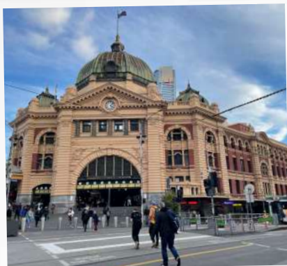
FUN IN MELBOURNE

to Mareeba just in time for the annual Rodeo which is always fun. The girls enjoyed all the fairground rides with their friends, while we set up a base in the arena and watched all the horse and bull-riding events! It is definitely a true Aussie outback experience that we have come to love! Now we're heading into the busy season for Markets in the lead up to Christmas - so our downtime will be quite full!