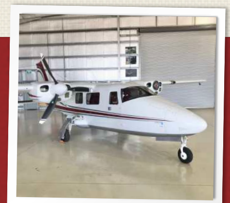
MULTI-ENGINE PILOT TRAINING AIRCRAFT