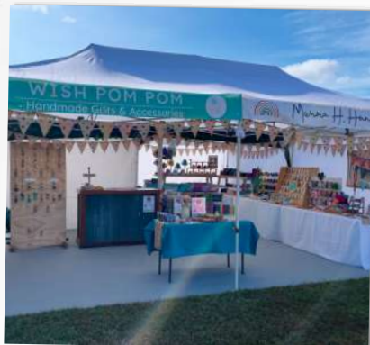
ROTARY FIELD DAYS