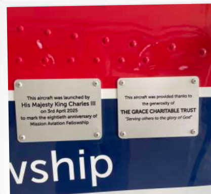
THE AIRCRAFT THAT KING CHARLES UNVEILED