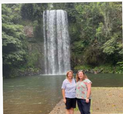
VISITORS FROM THE UK